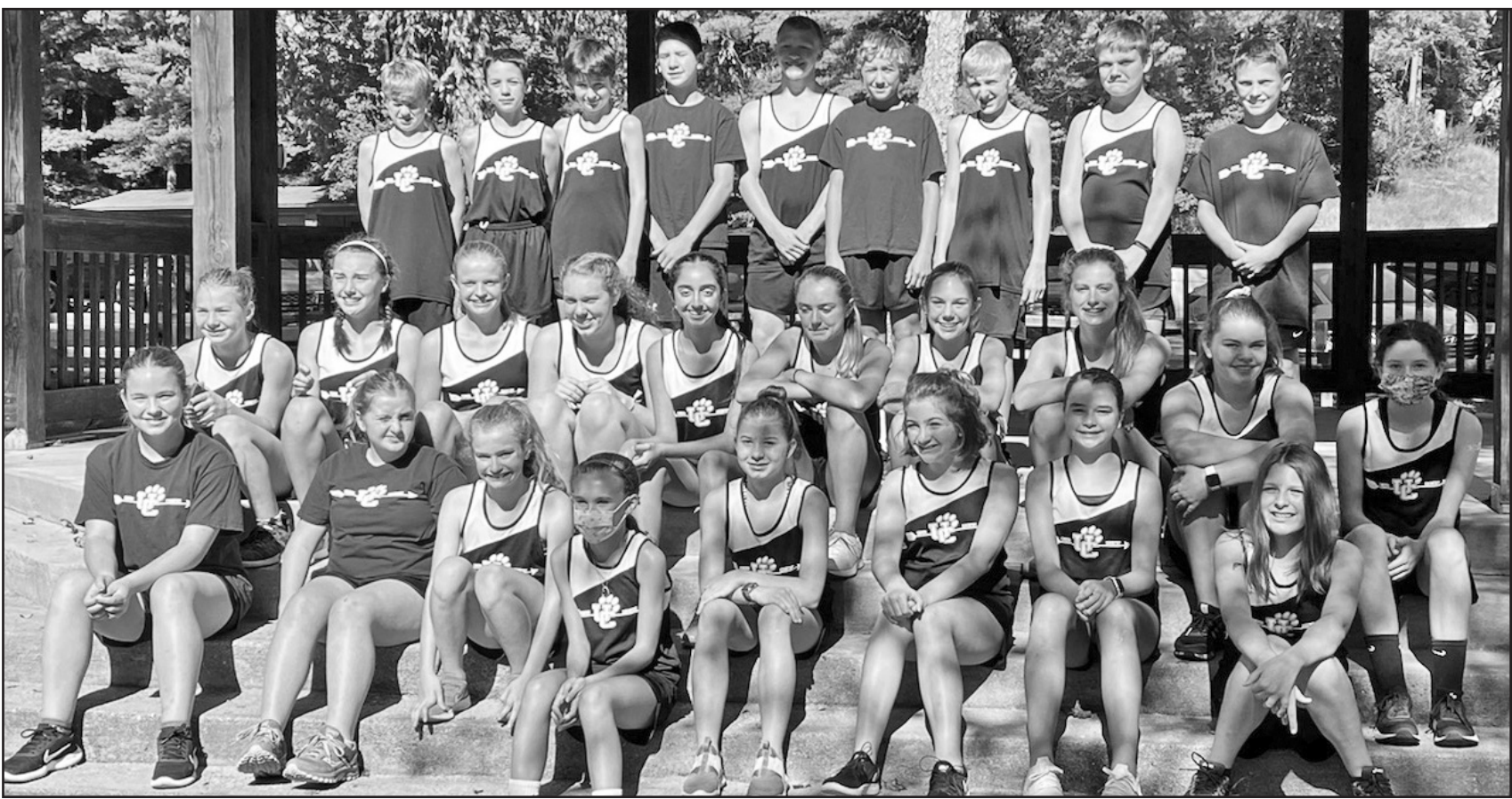
The Union County Middle School Cross Country team featured 33 runners this fall from grades 6-8. Cross Country is the only sport at UCMS open to sixth graders.

"The boys were pretty young but the girls team will